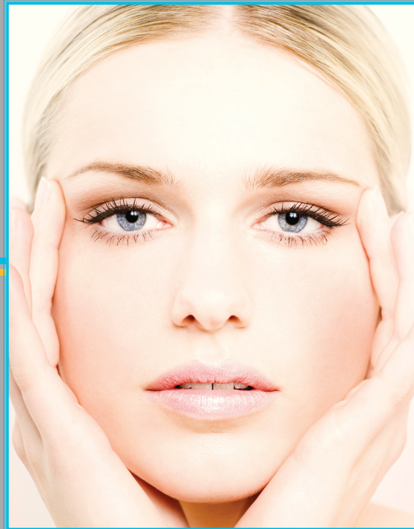
Simple. Effective. Results.™