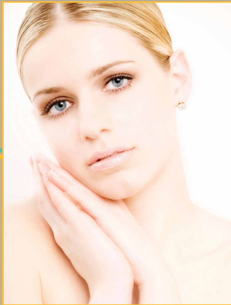
The Difference Is Real.™